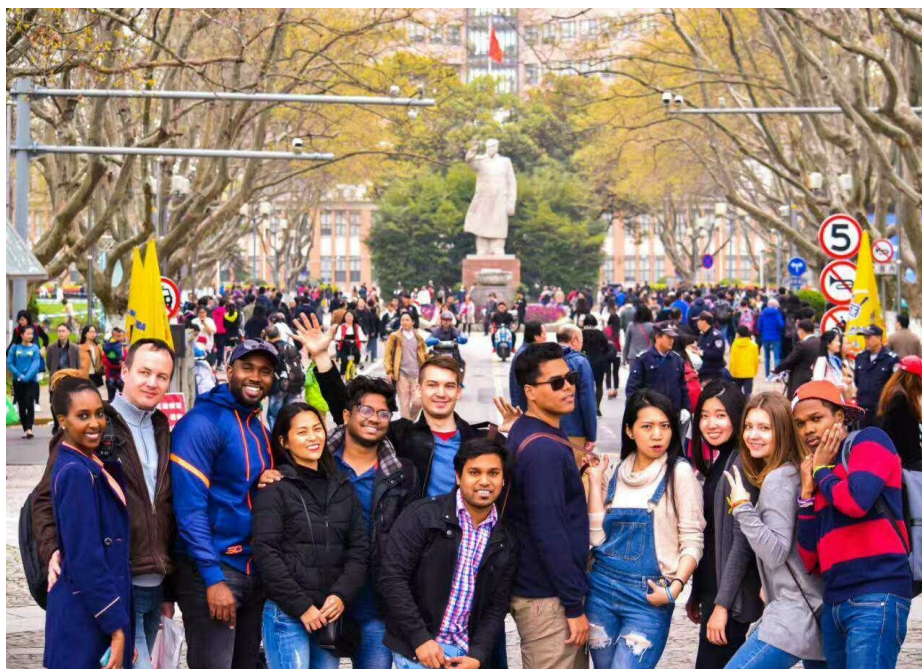
Students life at campus